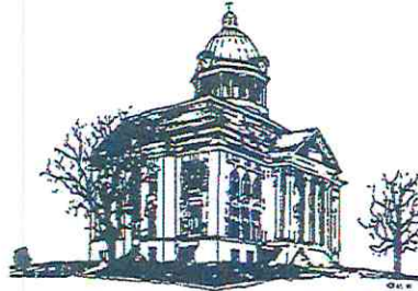
The Giles County Courthouse

TELEPHONE (931) 363-2424 FAX (931) 424-1436